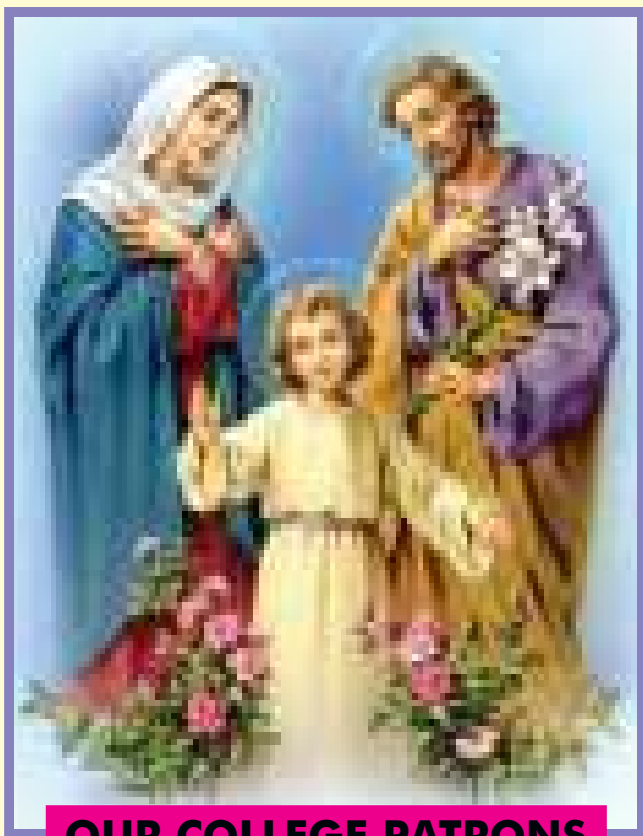
OUR COLLEGE PATRONS